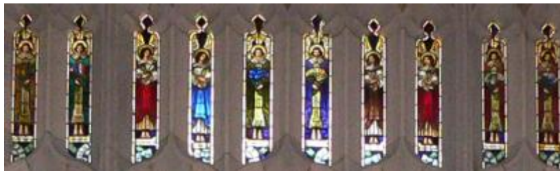
Ten Virtues of the Virgin Mary: Reason, Justice, Prudence, Hope, Moderation, Mercy, Faith, Modesty, Charity and Innocence