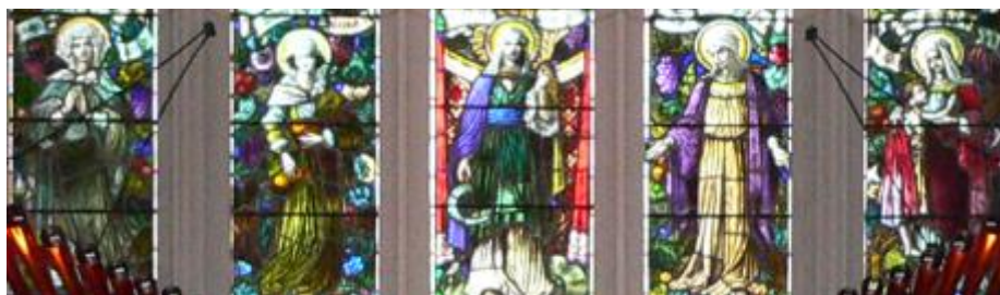
"Widow of Nain, Luke 7," "Martha, Luke 1," "Ruth," "Wife of Pontius Pilate," "Dorcas, Alms and Good Works"