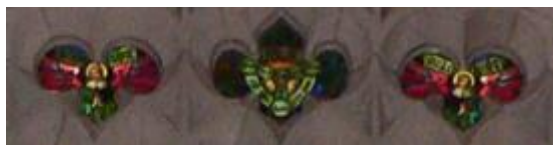
Three Trefoils: "Hosannah," "Shield of the Holy Trinity," and "Alleluia"