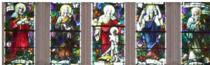
"Mary Magdala, Saint," "The Widow's Mite," "Elizabeth and St. John [the Baptist]," "Lydia of Thyatira," "Mary the Mother of James [and] Salome"