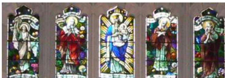
"Daughter of Jairus, Mark 5," "Anna the Prophetess," "Mary the Virgin and Jesus," "Joanna Who Served," "Mary Who Chose the Better Part"