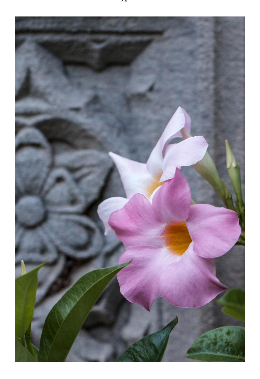
Twenty-fourth Sunday after Pentecost HOLY EUCHARIST RITE II October 30, 2016 10:30 a.m.

A place to discover connections with God and one another www.sjparish.net