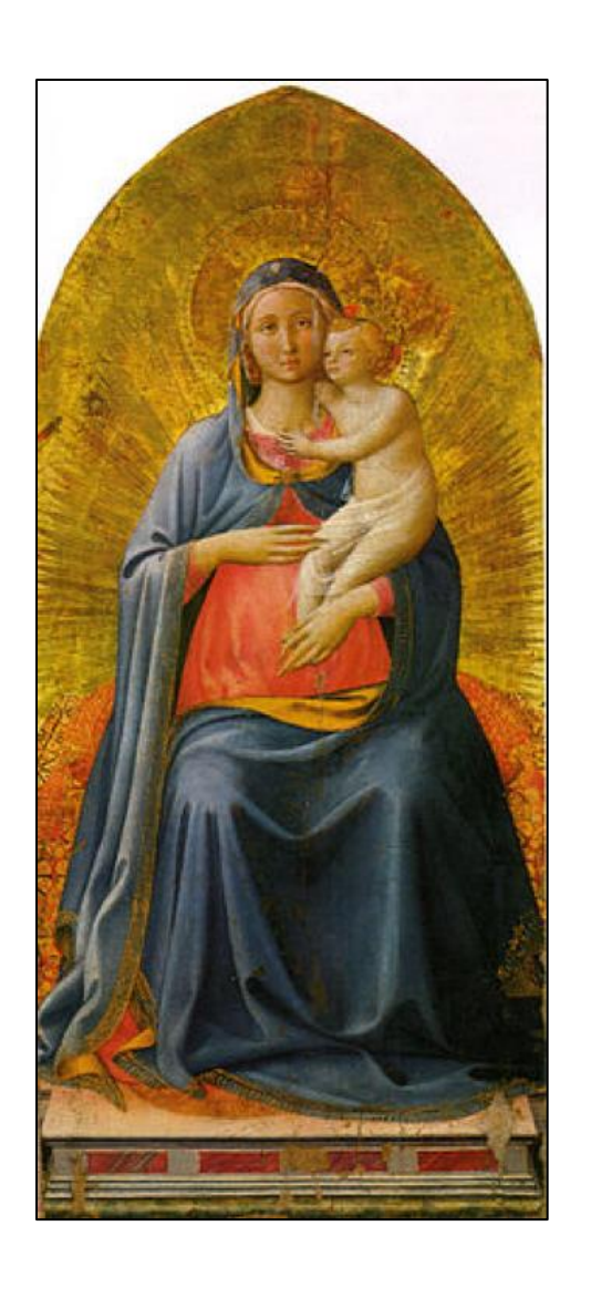
The Nativity of Our Lord Jesus Christ FESTAL EUCHARIST December 24, 2016 11:00 p.m.

A place to discover connections with God and one another www.sjparish.net