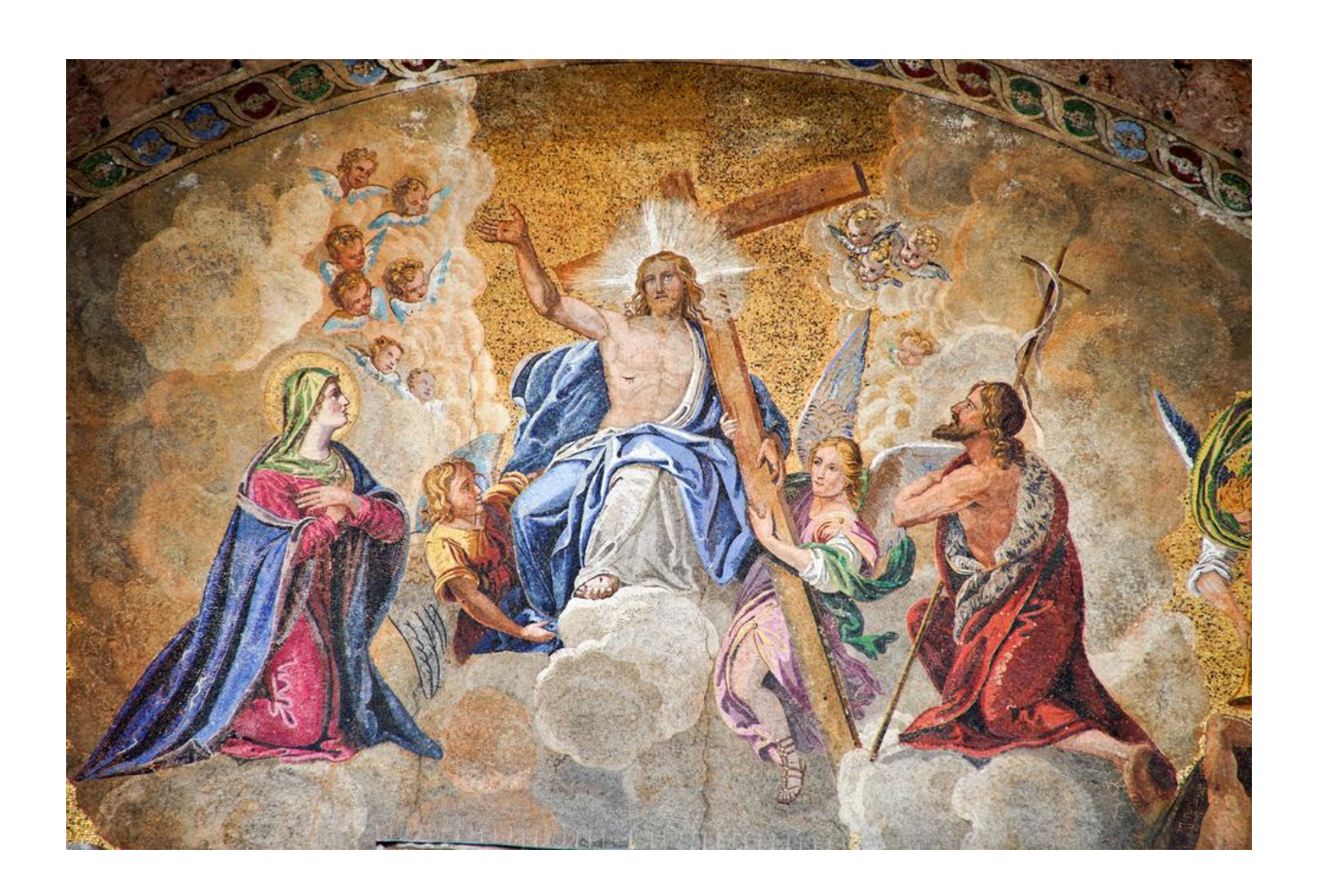
The Fourth Sunday of Easter HOLY EUCHARIST May 7, 2017 10:30 a.m.

A place to discover connections with God and one another www.sjparish.net