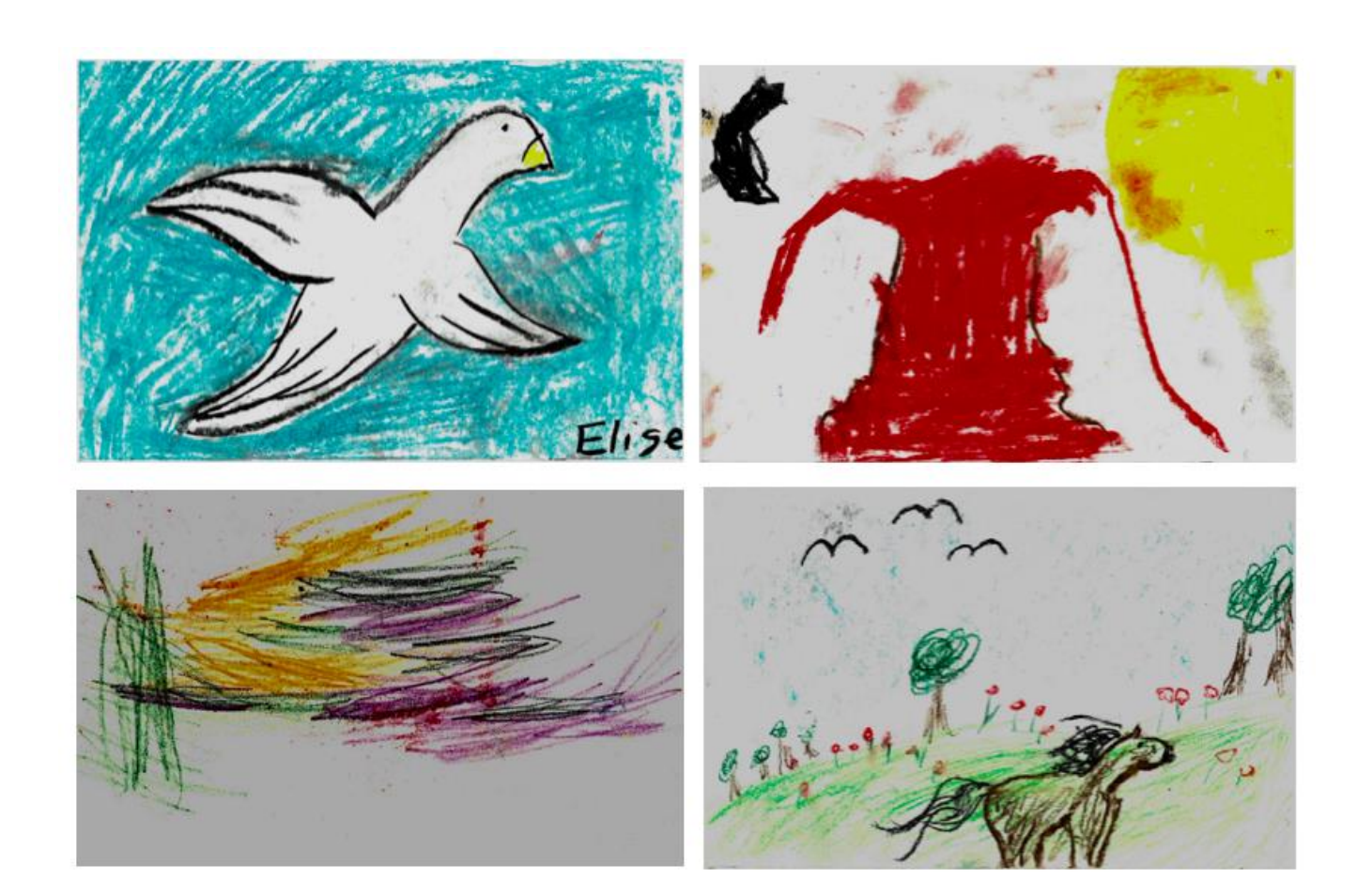
The Sixth Sunday of Easter HOLY EUCHARIST & YOUTH SUNDAY May 21, 2017 10:30 a.m.

A place to discover connections with God and one another www.sjparish.net