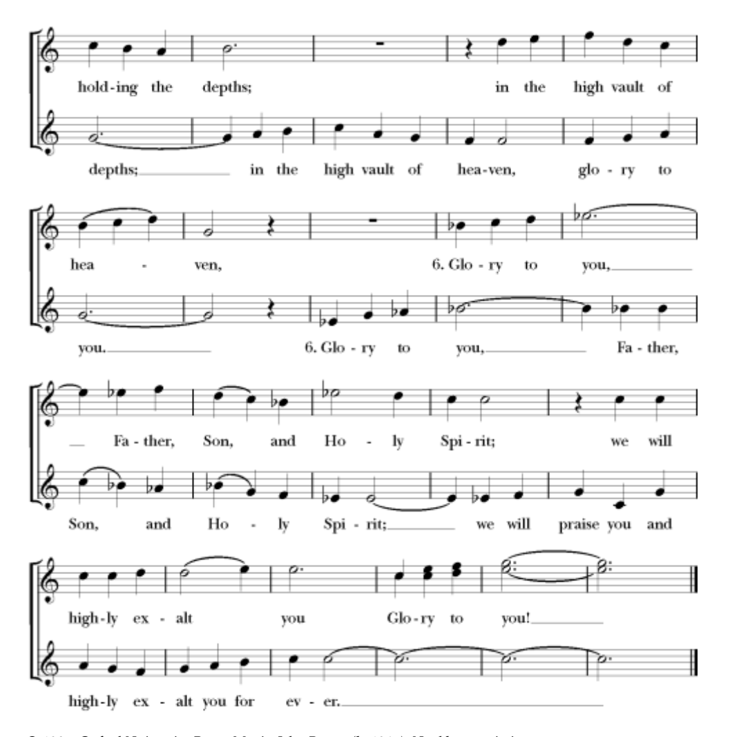
\ \odot 1985, Oxford University Press. Music: John Rutter (b. 1945). Used by permission